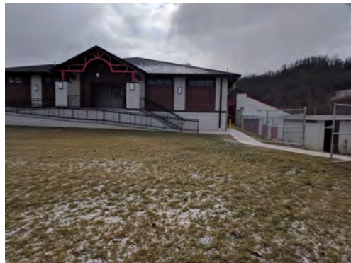
Polling Location Bellaire School Field House 320 W. 26th Street Bellaire, OH 43906