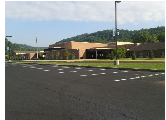
Polling Location Bridgeport High School 55707 Industrial Dr Bridgeport OH 43912

Liquor Control Local Option Required Signatures 130