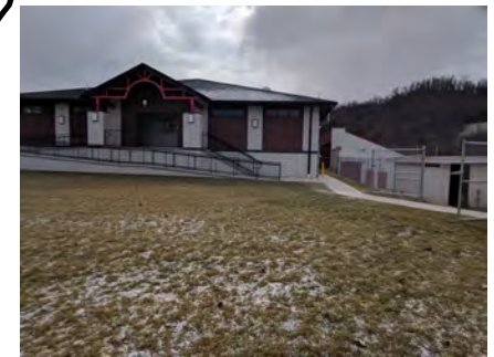
Polling Location Bellaire School Field House 320 W. 26th Street Bellaire, OH 43906